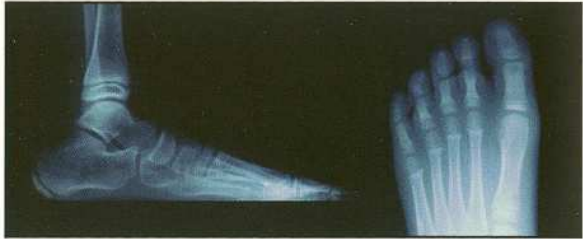
An x-ray can show damage to a bone growth plate.

The foot's bone structure is pretty well formed by the time your child reaches age 7 or 8. But if a growth plate (the area where bone growth begins) is injured, the damaged plate may cause the bone to grow oddly. With a doctor's care, however, the risk of future bone problems is reduced.